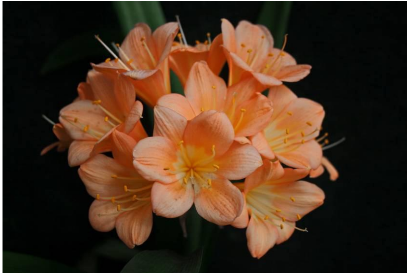
Naude's F1 pastel

Obtaining pollen from Naude's Peach, not knowing to which group it may belong and the only pod parent available we pollinated a F1 orange Natal yellow grp2 x group 1 yellow. The seedlings from this cross varied from normal orange to pastel in flower colour. Two of these pastels were selected for quality flowers and labelled F1 Naude's Peach split yellow.